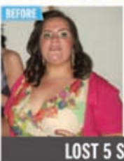
LOST 5 STONE!