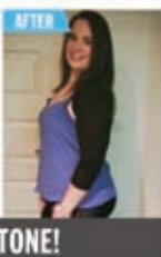
LOST 8.5 STONE!