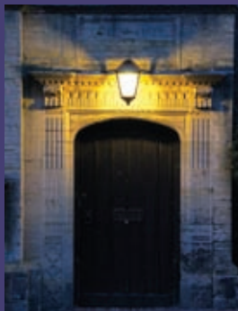
The Queen's Hall at dusk