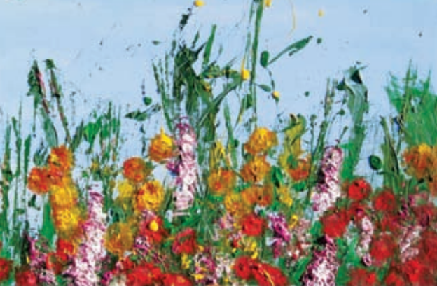
Image above is by Allison Day called 'Painter Painted Red' Image right is by Anna Conversano called 'Japan'