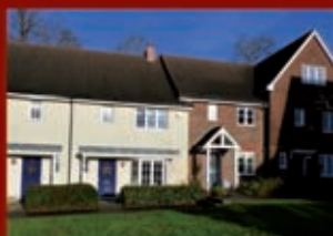
CUCKFIELD 3 bed family house £359,950