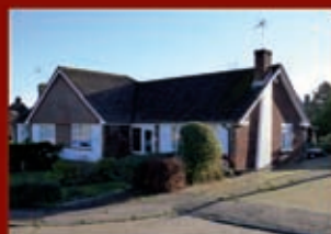
CUCKFIELD 2 bed semi-detached bungalow £350,000

For more information about any of the above properties for sale or to arrange a free valuation please call Richard Butler on 01444 417600 or email us at cf@mansellmctaggart.co.uk