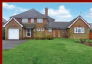
CUCKFIELD 5 bed detached house £895,000

A selection of properties currently for sale in and around the village