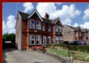
BALCOMBE 3 bed semi-detached £445,000