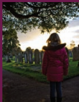
Winter sunset over Holy Trinity's churchyard