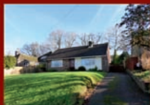
BALCOMBE 3 bed detached bungalow £429,950