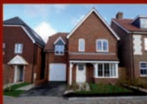
CUCKFIELD 4 bed detached £490,000