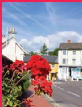
David Tingley As summer view looking West on Broad Street